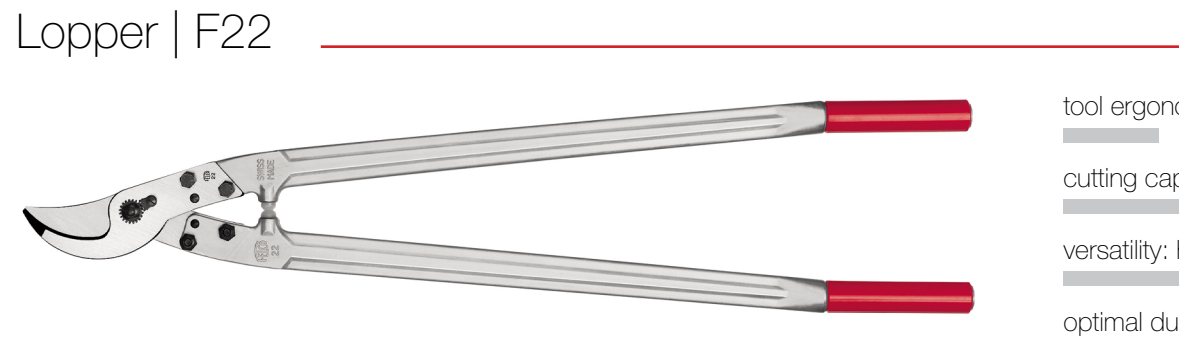
tool ergonomics: basic