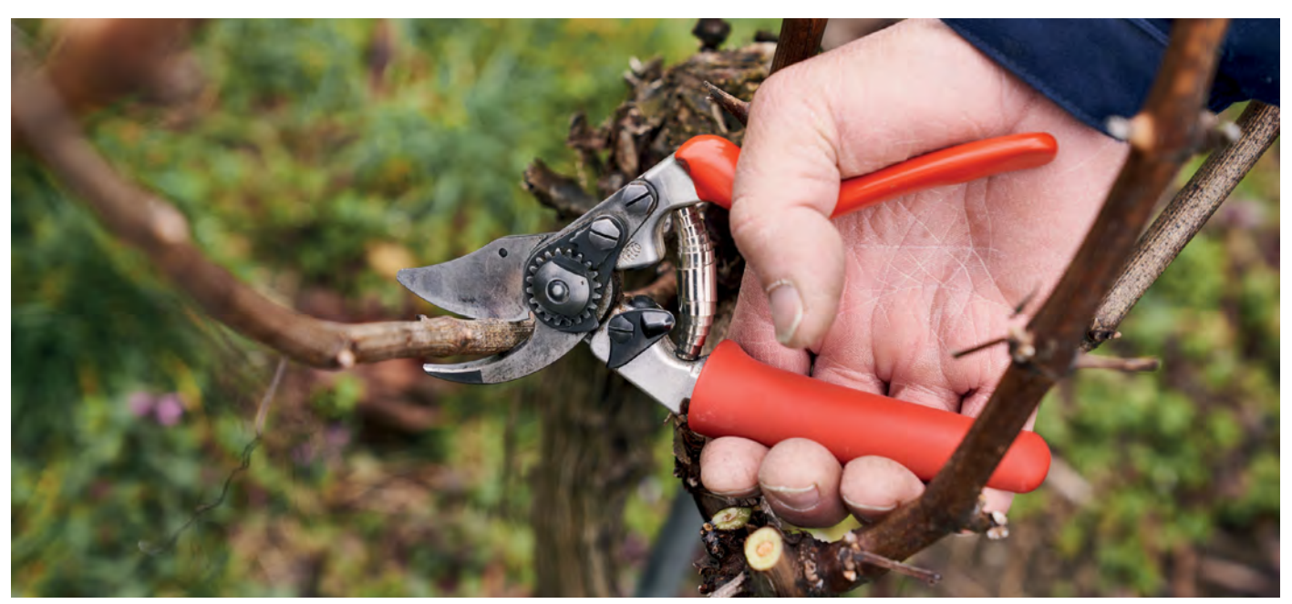
FELCO 15 in use