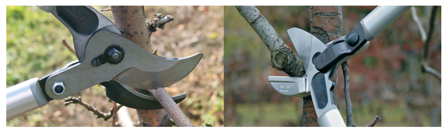
Comparison of bypass (FELCO 220) and anvil (FELCO 230) cutting heads

Anvil cutting heads require the blades to make a smaller opening to cut a piece of material against a flat surface, requiring less effort and producing a symmetrical cut. However, if not maintained properly, an anvil cutting head has a higher risk than a bypass tool to crush or damage material.