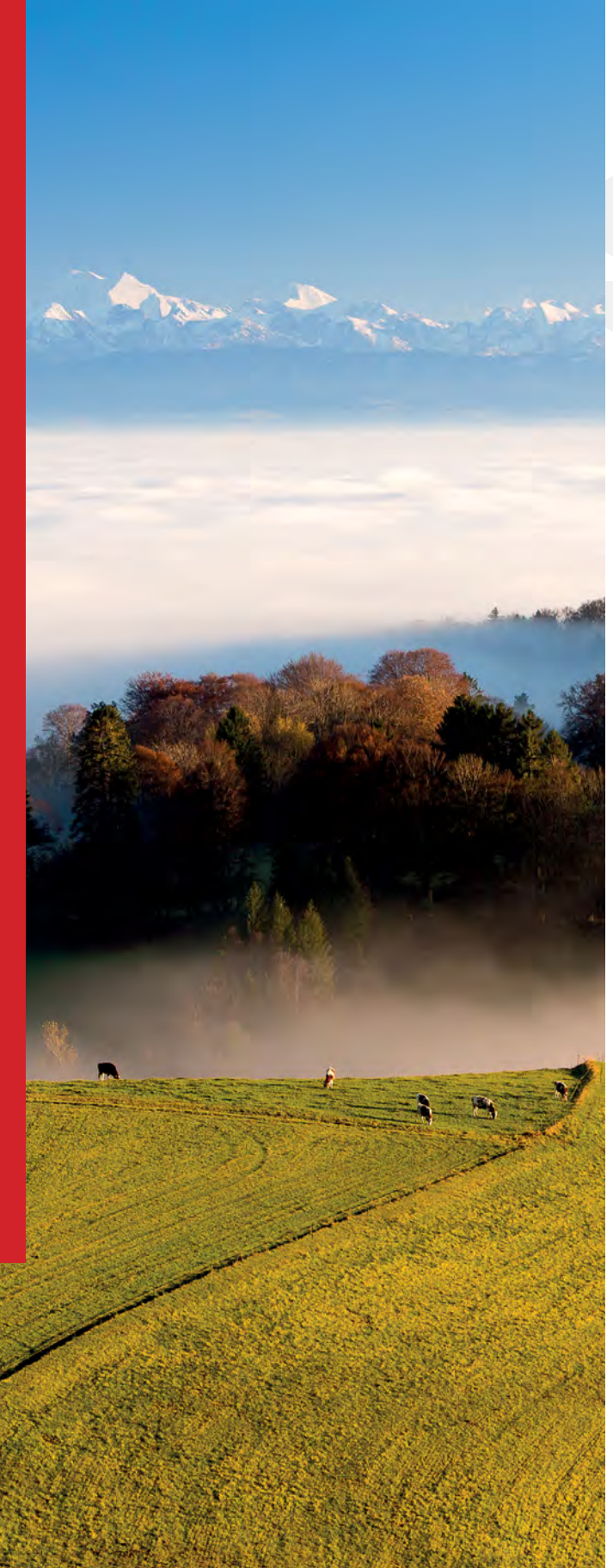
View of Switzerland from Neuchâtel Region

Transparency, Freedom, Accountability For all our employees.