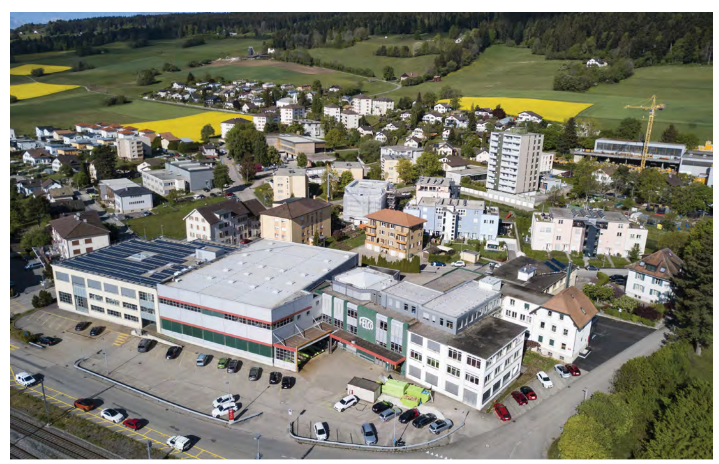
Les Geneveys-sur-Coffrane, Switzerland

As the demand for products was increasing each year, FELCO was faced with the challenge of transforming a limited craft production into a large-scale industrial activity. This transition had to maintain, and even strengthen, key success factors such as consistency of quality. Targeting large scale production with limited cost and short lead-time was a priority. The control of key suppliers such as PRETAT for forging, and key technologies such as robotic and CN machining all supported this strategy.