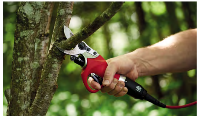
Arboristry / Forestry | page 26