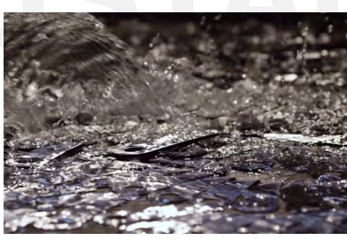
Use of recycled coolant and lubricant for grinding