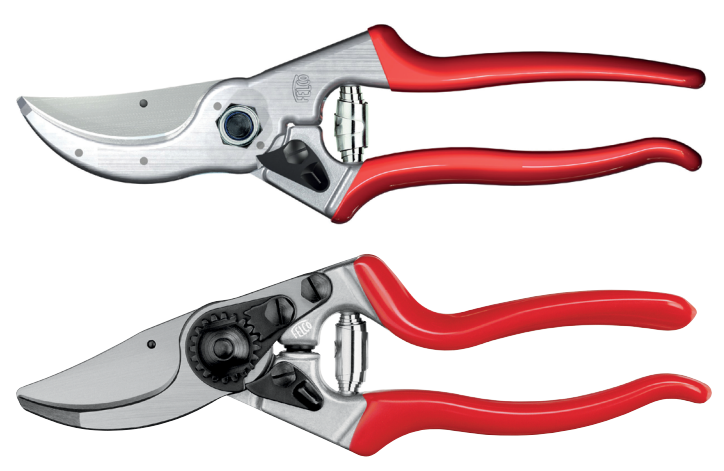
Comparison of straight (FELCO 4) and ergonomic (FELCO 8) tools

Ergonomic tools are for specific purpose. By using an ergonomic tool, you will be provided with more comfort, precision and less effort will be needed as long as it is held in the correct position.