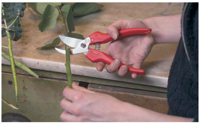
Snip cutting head in stainless steel

High Carbon Steel is used on all pruners, loppers, and cable cutters blades. It offers the best compromise between tenacity, elasticity and hardness. However, it has the disadvantages of being high cost, hard to manufacture, and does not have natural resistance to corrosion.