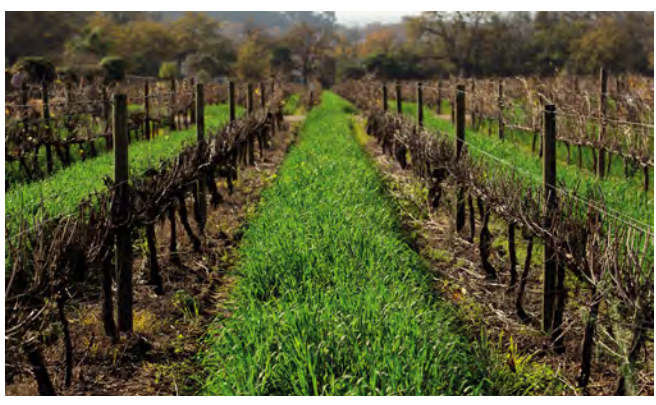
Grapes & Vineyards | page 25