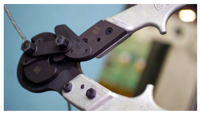
Cable cutter gearing mechanism

The disadvantage of a gearing mechanism is that it requires the product's handles to be wide open, therefore limiting reach and maneuverability.