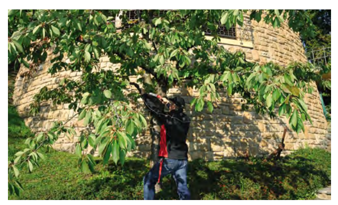
Landscaping / Municipalities | page 21