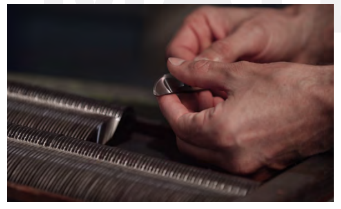
Cutting blades in high carbon steel

In order to meet these criteria, FELCO has been working with 3 distinct types of materials: High Carbon Steel , Stainless Steel & Chrome-Plated Carbon Steel .