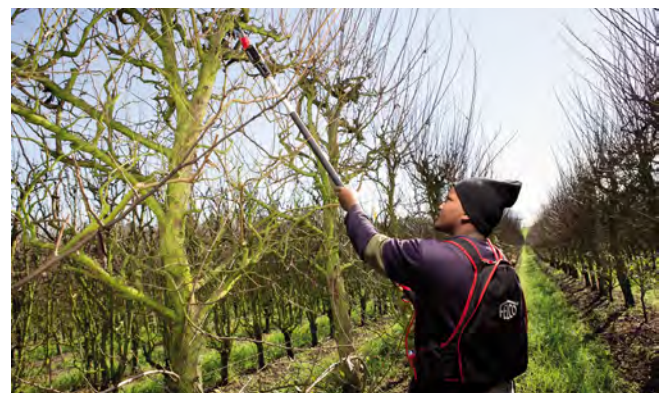
Fruit & Nut Trees / Orchards | page 24