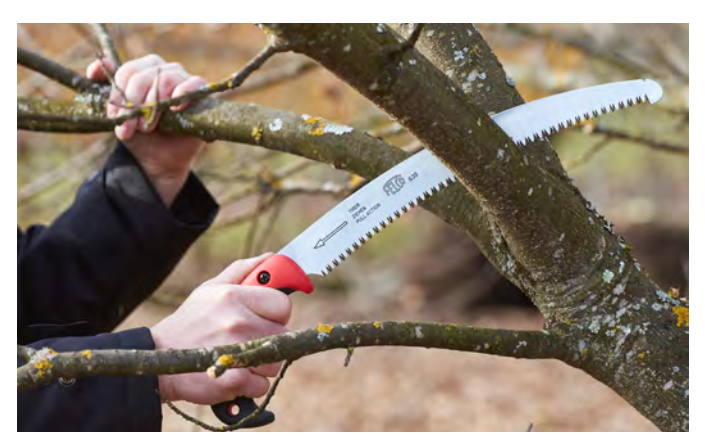
Saw blade in chrome-plated carbon steel

Stainless Steel is used on snips and knives blades. It has the advantage to resist corrosion as it is stainless, which means that no matter how many times you clean it the blade will not rust. However, it does not fully meet the 3 criteria especially in terms of hardness and tenacity.