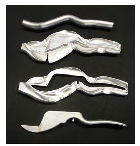
Various steps to manufacture a forged aluminum handle