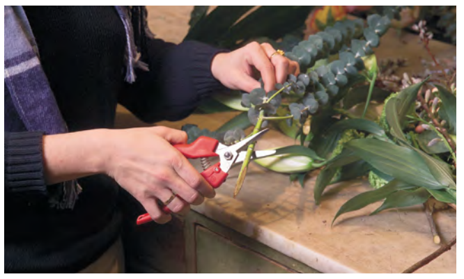
Horticulture | page 22

The following pages contain our recommendations for tools that are useful in these settings. Applicable tools are not limited to those shown.