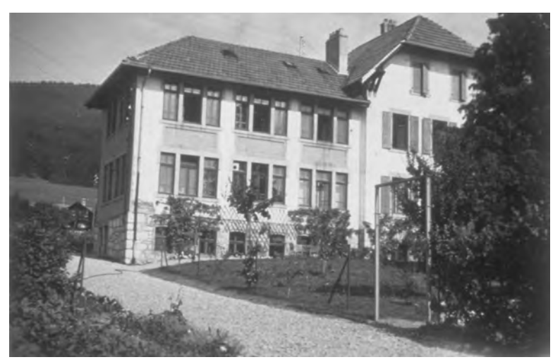
Original factory FELCO 1945

Since the beginning, FELCO's goal was to produce and create products that fit to the user's ergonomics. As each new family of products was being invented throughout the years, the emphasis on the user's comfort which differentiated FELCO tools from any other agricultural products was the main priority.