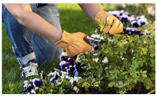
Other Settings | page 27